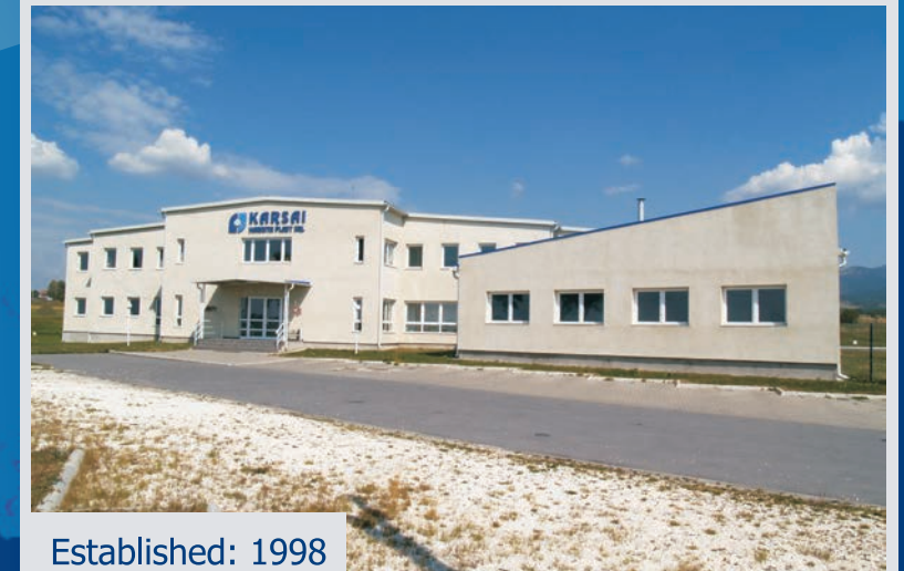
SC KARSAI HARGITA PLAST SRL. Szentegyháza